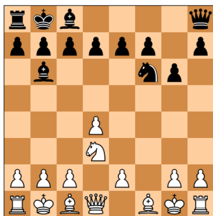
1) P. Wassong 1HM, RIFACE 2019

Sol 3: re1.c4 a5 2.c5 a4 3.c6 Ra5 4.cxd7=R c6 5.f4 Qb6 6.f5 Qa6 7.f6 b6 8.fxe7=B f5 9.Sc2 Kf7 10.Sa3 Kxe7 11.Kc2 Kxd7+ 12.b4 axb3 e.p.++ 13.Sb1 RB Schnoebelen + en passant